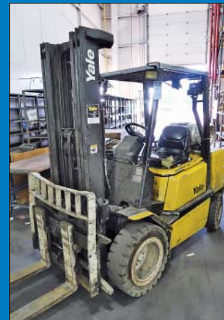
6,000 LB Yale Model G1p060 Pneumatic Outdoor Tire LP Gas Lift Truck