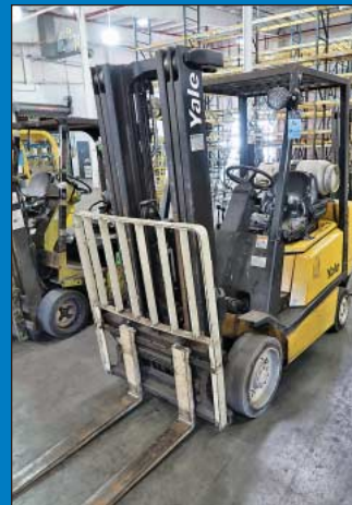
5,000 LB Yale Model G1c050 Solid Tire LP Gas Lift Truck