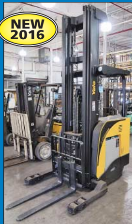
NEW 2016 4,500 LB Yale Model NR045 Stand Up Electric Reach Truck

auctioneers | appraisers | since 1961 | cia-auction.com | info@cia-auction.com 2020 Dunlap St., Cincinnati, Ohio 45214 Phone 513-241-9701 Fax 513-241-6760